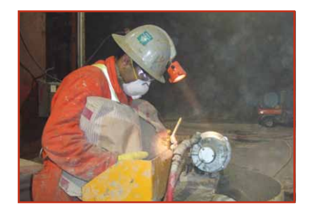
Sifto Salt, Goderich Mine, Ontario Chemical grout, applied as spray foam, was used to seal a five meter high by eight meter wide underground ventilation bulkhead. A layer of cement grout (in the form of spray foam) was applied over top for fire protection purposes.