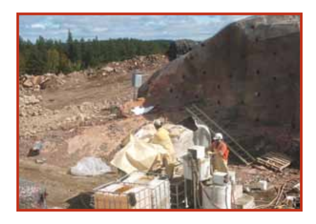
FNX Mining, Podolsky Mine, Ontario Pre-grouting of raise bore holes was completed using microfine cement grouts, equipment and technical support.